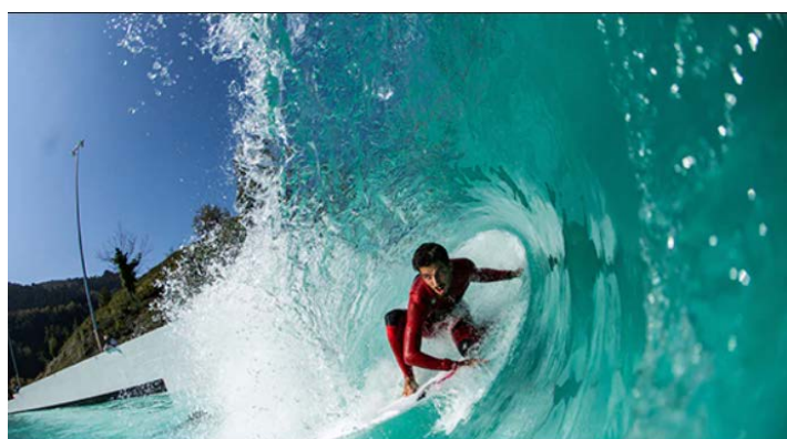
Generating artificial waves and surf lagoons with Autodesk BIM